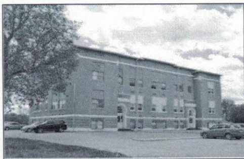
After the North West Hendricks consolidation in 1975, the Lizton school building, completed in 1922, was sold and converted into apartments.